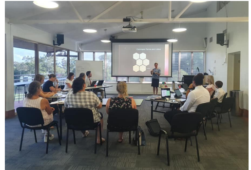
Teachers collaborating at one of our TeachMeets