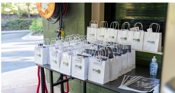
Goodie bags for conference attendees!