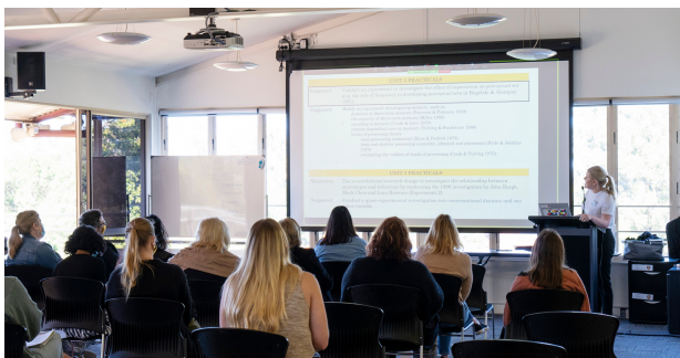
Conference attendees heard from resourceful experts in the field